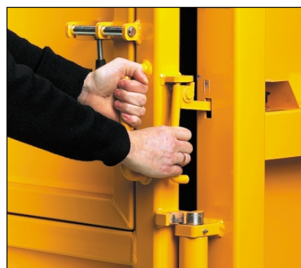
A strong safety lock ensures that the door opening is gradual.